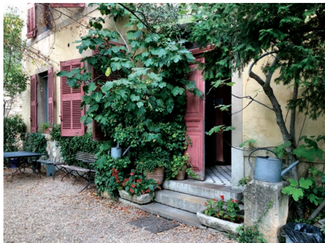
Atelier Cézanne at Les Lauves