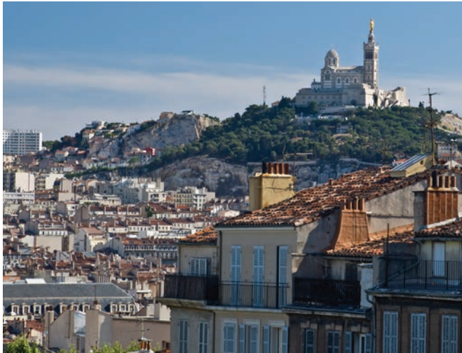
Basilica of Notre-Dame de la Garde, Marseille