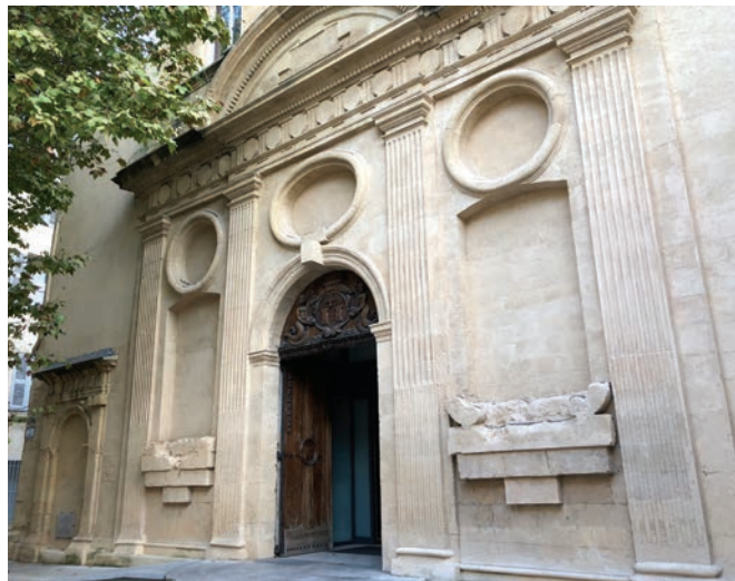
Musée Granet XXe