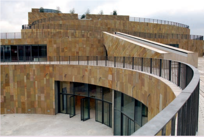
Grand Théâtre de Provence