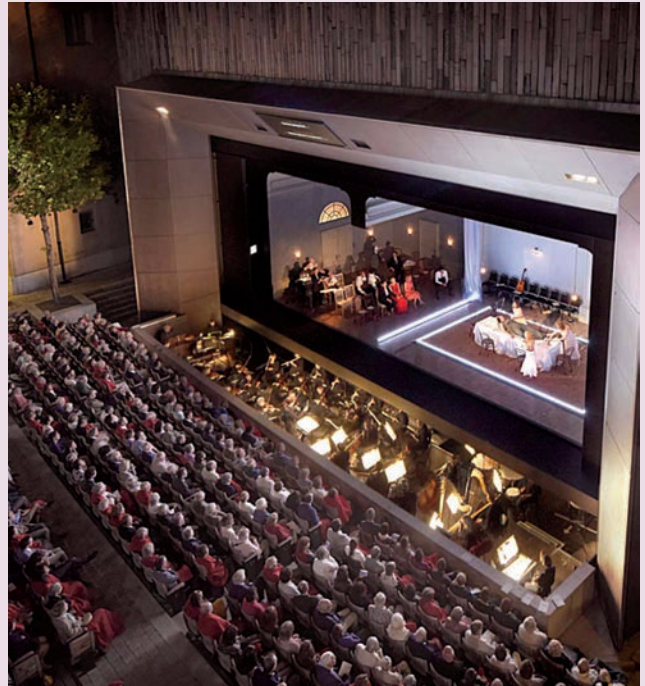
Théâtre de l'Archevêché