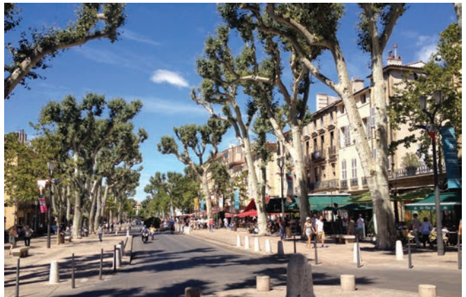
Cours Mirabeau, Aix-en-Provence

A deposit of $2,250 per person is requested to confirm a place, of which $1,500 is non-refundable to cover advance payments for tickets and hotels. The balance is payable by May 17, 2022, and at that time the full amount becomes non-refundable