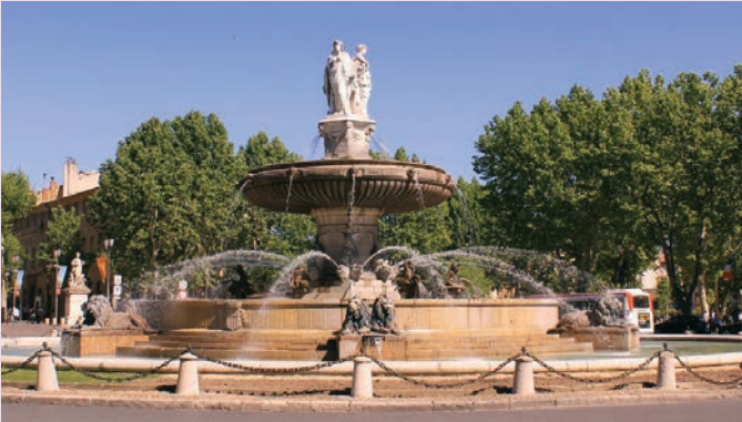
The Fontaine de la Rotonde, Aix-en-Provence