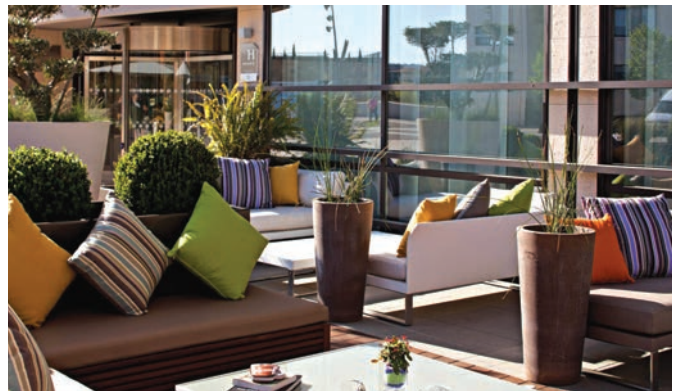
Atmosph'R lounge terrace at the Renaissance Aix-en-Provence Hotel

Its capital, Aix-en-Provence, has more than its fair share of attractions, drawing discerning visitors to revel in its history, art and architecture and gastronomy, in the form of locally sourced fine food, wines and other products of its distinctive agriculture. The Festival d'Aix-en-Provence, headed by the French-Lebanese theatre director Pierre Audi since 2018, stages operas with the highest caliber artistic content and a broad variety of concerts and recitals. The 2022 program during the time we have selected includes three fully staged operas, Strauss' Salome , Mozart's great choral opera Idomeneo and Moses and Pharaoh by Rossini and these will all be included in the musical program. In addition we will attend a concert performance of Bellini's Norma and offer Gluck's Orpheus and Eurydice as an option.